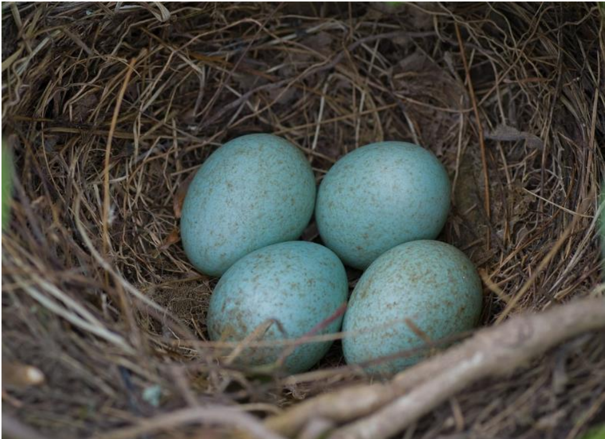
Blackbird ( Turdus merula ) nest

The chalaza is an assembly of cross-linked fibres whose function is to hold the yolk in the centre of the egg.